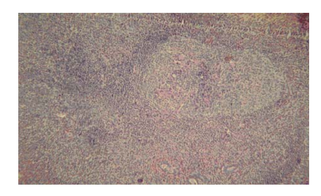
Fig. 2. Kimura disease. Hypertrophic follicle with germinal center in an enlarged lymph node.

Ryc. 1. Choroba Kimury. Ślinianka przyuszna. Gęste nacieki eozynofilów tworzące "mikroropnie".